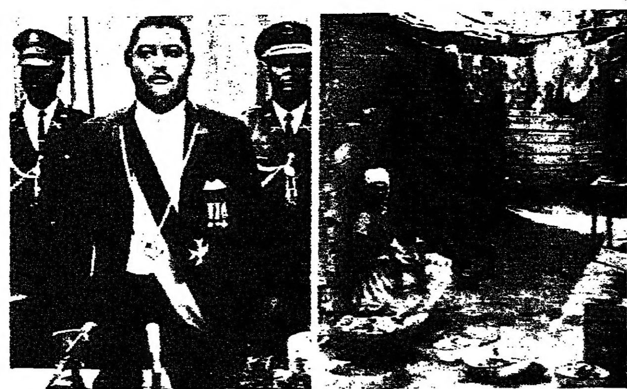
'Baby Doc' Duvalier, left, flanked by presidential guards; on the right is a Haiti slum scene.